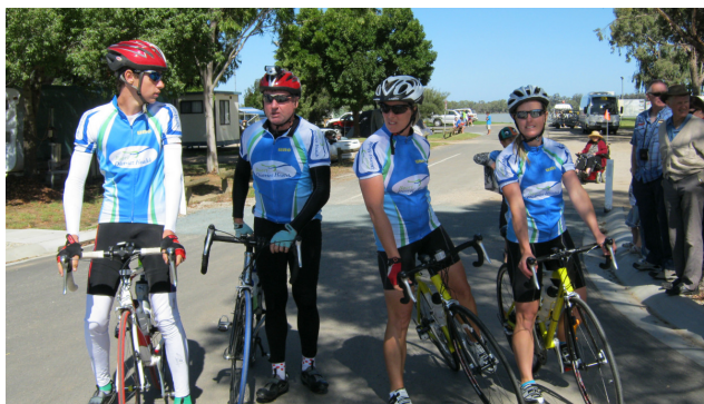
2011 Murray to Moyne cyclists

All other contributions are gratefully accepted and sponsors are recognised